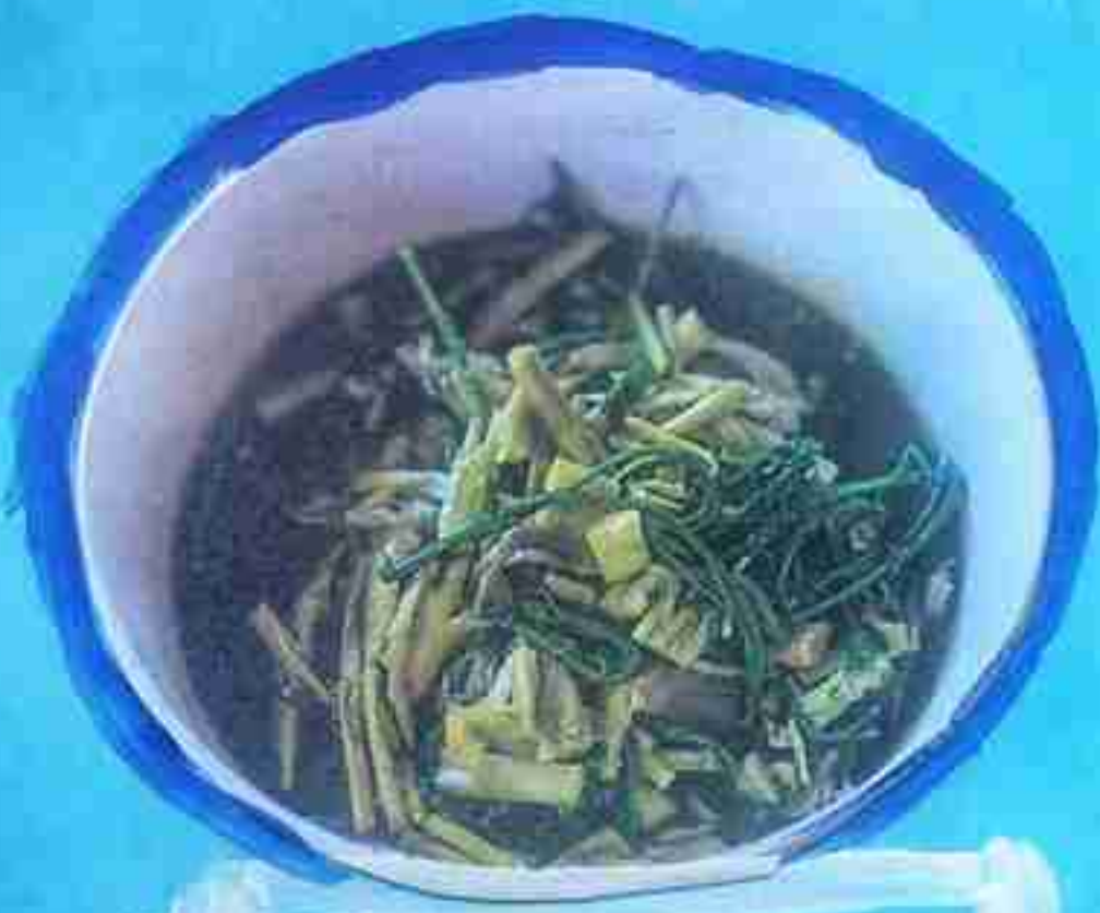
BAMBOO SHOOT CURRY